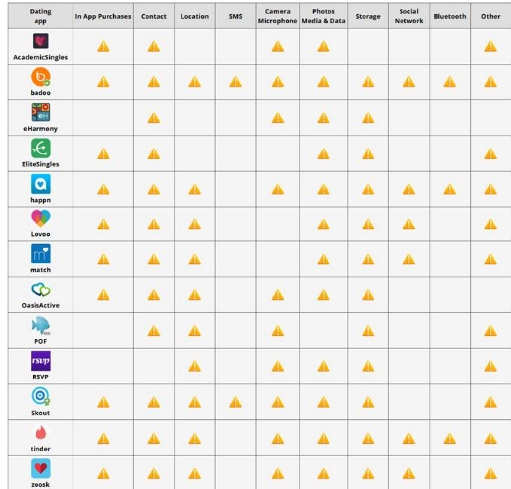
Access Permissions of Leading Dating Apps

The following infographic shows a summary of which access permissions each of the 13 apps take advantage of: